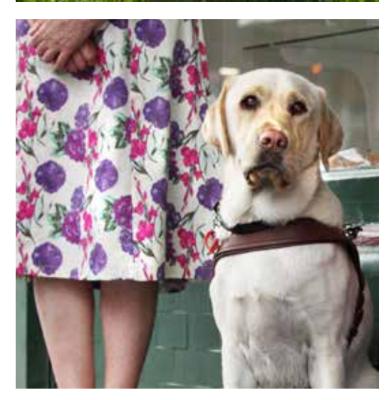
This Page (from top): Wendell and Whiskey ; Stella; Dexter.