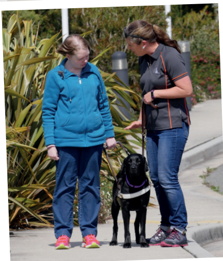
Test Drive a Guide Dog Day