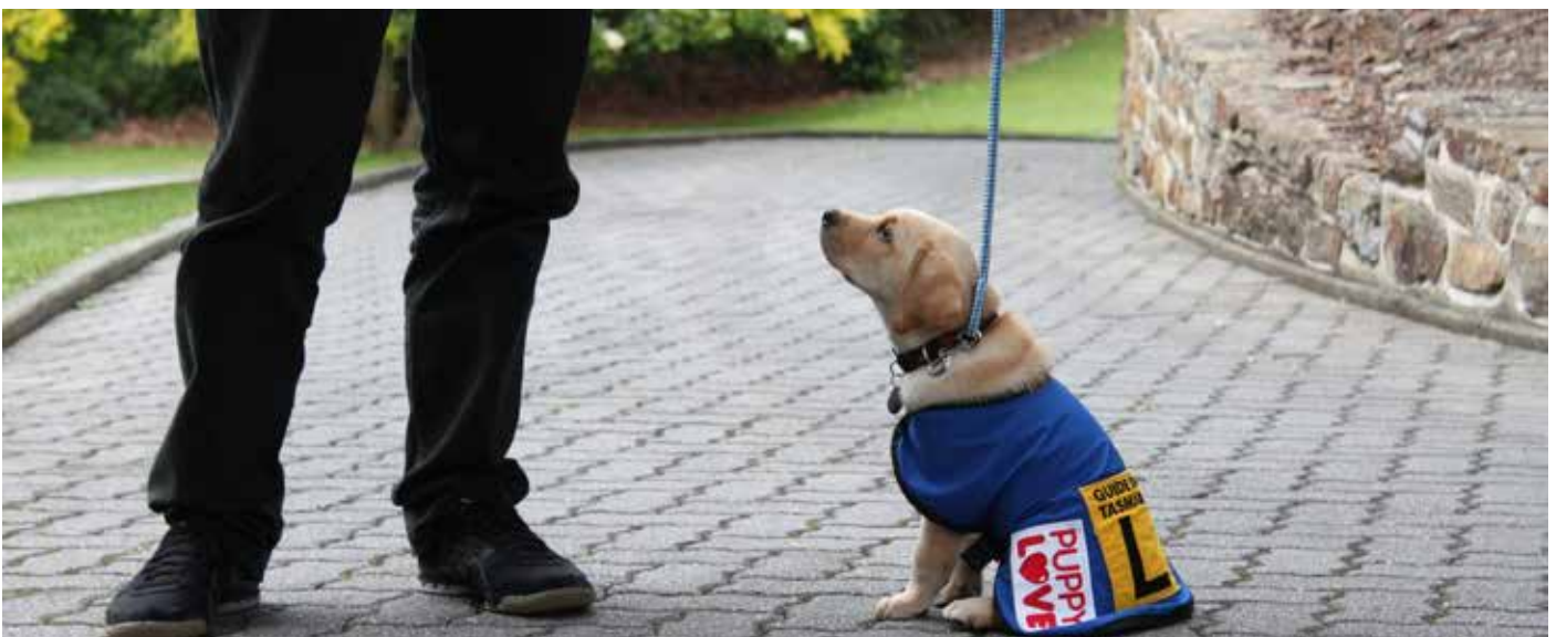
This Page: Puppy Quinnell, keen to learn all he can in the socialisation stage of his learning