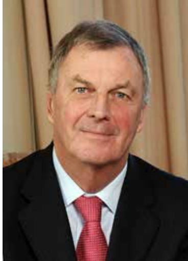
His Excellency the Honourable Peter Underwood AC Governor of Tasmania